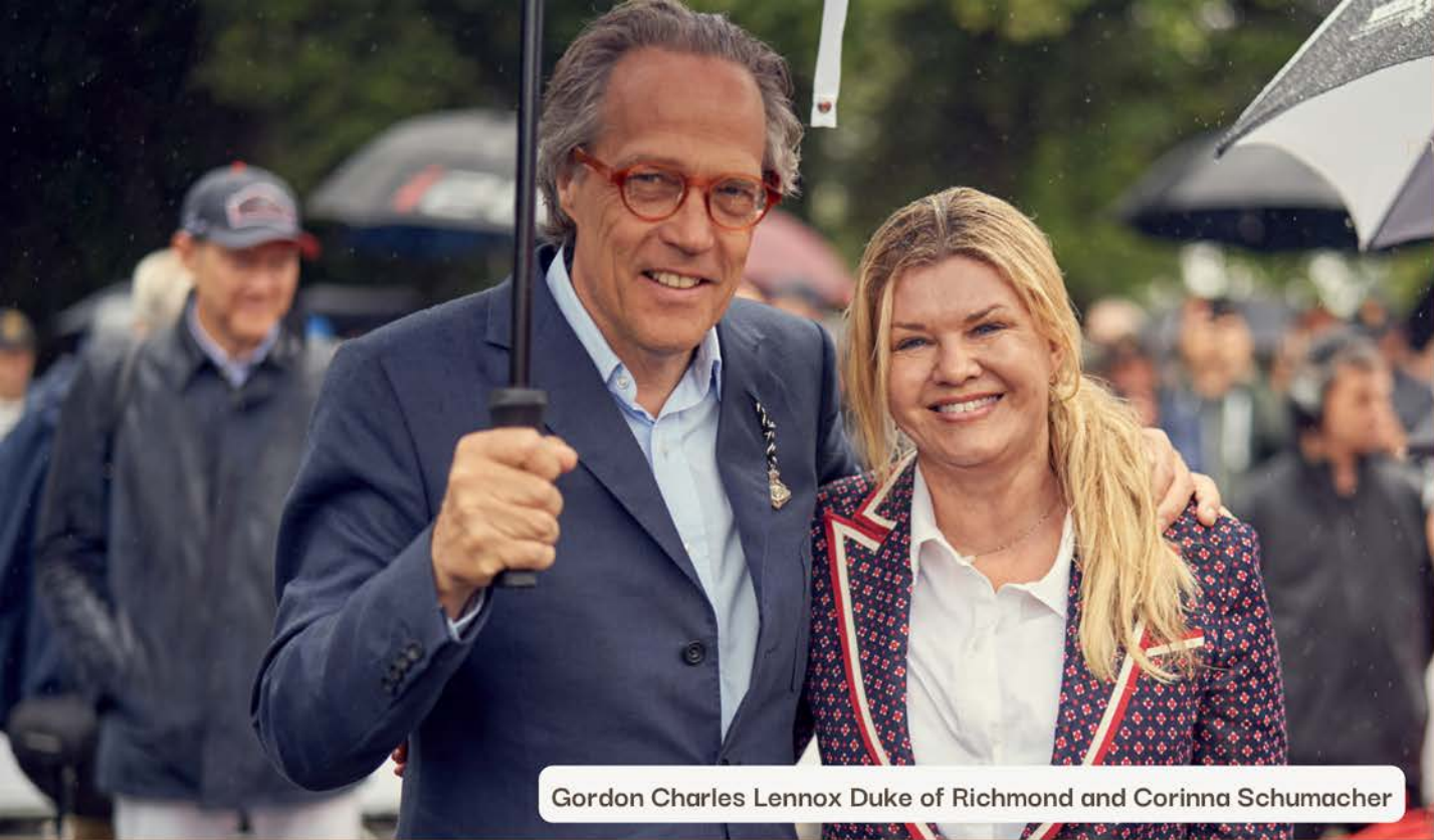
Gordon Charles Lennox Duke of Richmond and Corinna Schumacher