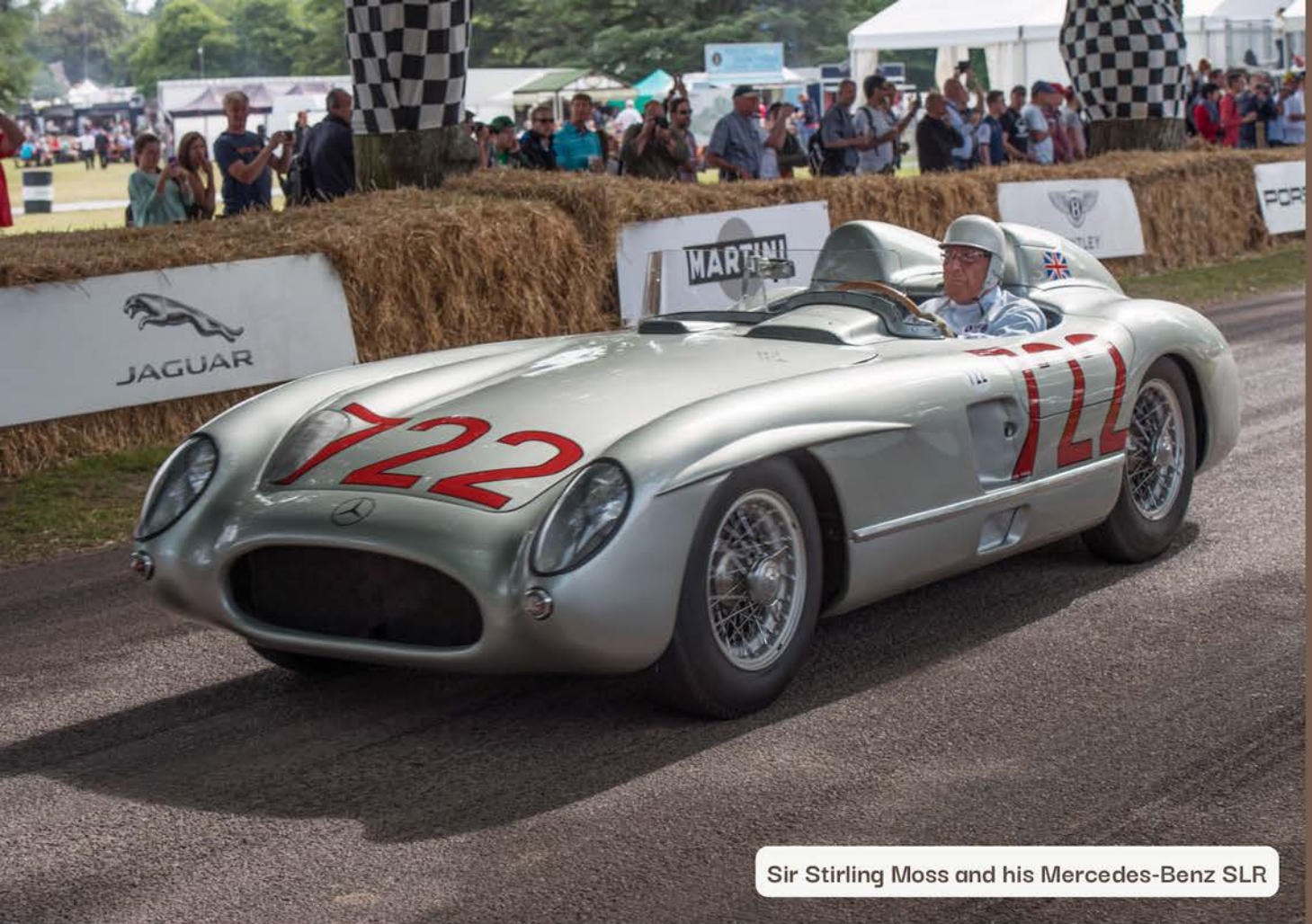
Sir Stirling Moss and his Mercedes-Benz SLR