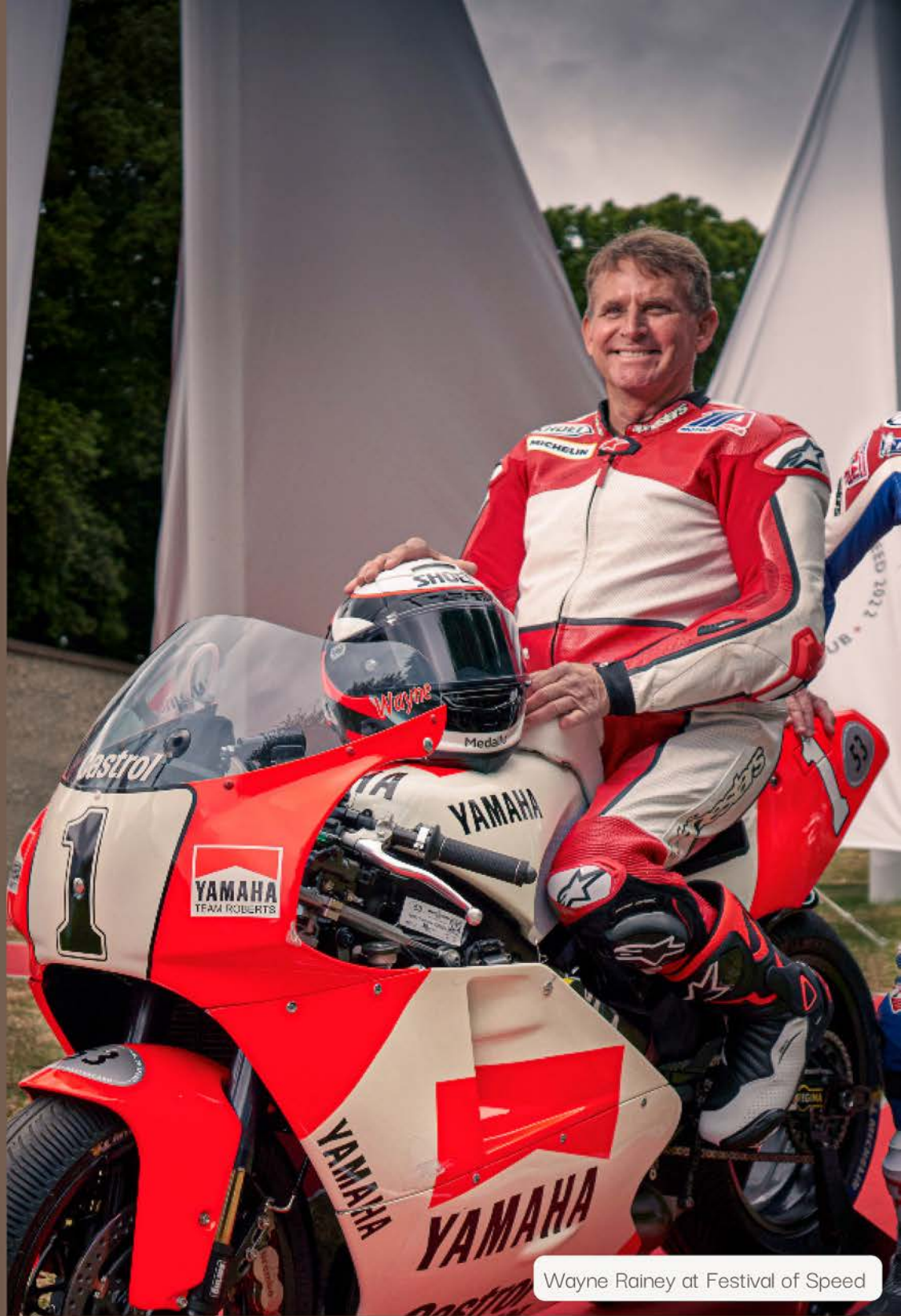
Wayne Rainey at Festival of Speed

* October 23, 1960 California World Champion 500ccm: 1990, 1991, 1992 with Yamaha 24 Moto GP wins in total