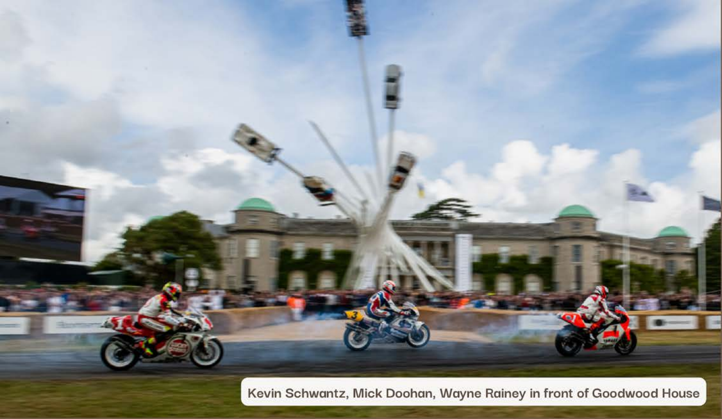
Kevin Schwantz, Mick Doohan, Wayne Rainey in front of Goodwood House