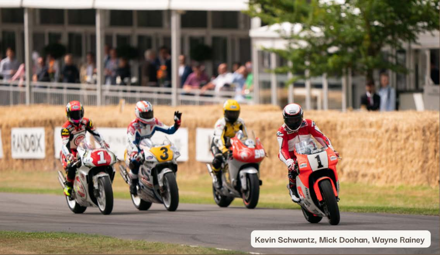
Kevin Schwantz, Mick Doohan, Wayne Rainey

In 2022, the moment finally arrived. Against the backdrop of the Goodwood Festival of Speed, a mecca for motorsport enthusiasts, Rainey once again mounted his Yamaha YZR500. "I was pretty nervous to ride the YZR500 because riding the R1 was pretty easy since modern bikes have so much electronics, but it's something else to ride a 500cc Grand Prix bike!" Rainey confessed. Yet, as he got on the bike, it felt like reuniting with an old friend. "It was always challenging to ride the bike at this level, to win races and championships, but to be here, 30 years later, able to get on the bike and ride it up the hill in a nice, easy, gentle setting is fantastic."