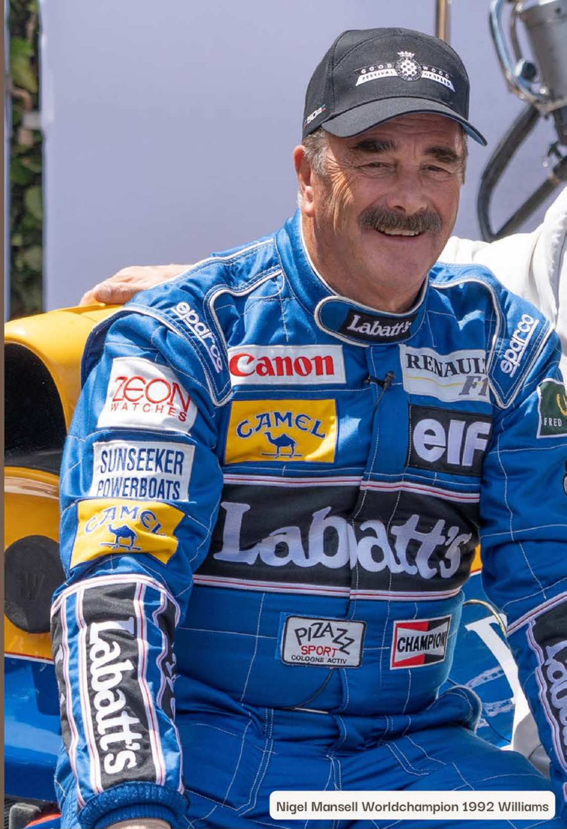
Nigel Mansell Worldchampion 1992 Williams

* August 08, 1953 in Upton-upon-Severn Formula 1 Debut 1980 with Lotus Formula 1 Worldchampion 1992 with Williams 31 Formula 1 Grand Prix wins total