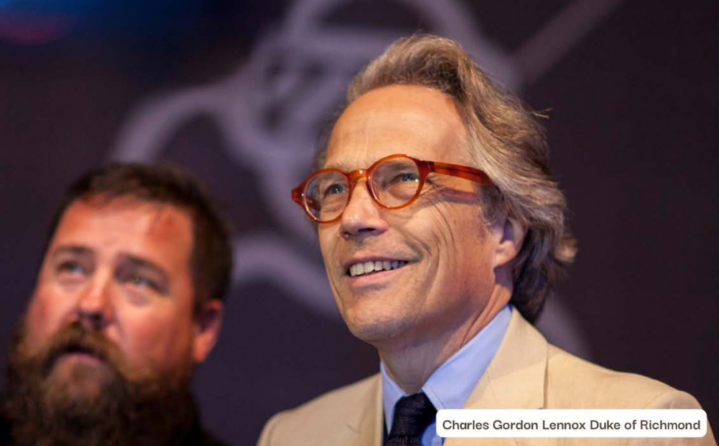
Charles Gordon Lennox Duke of Richmond