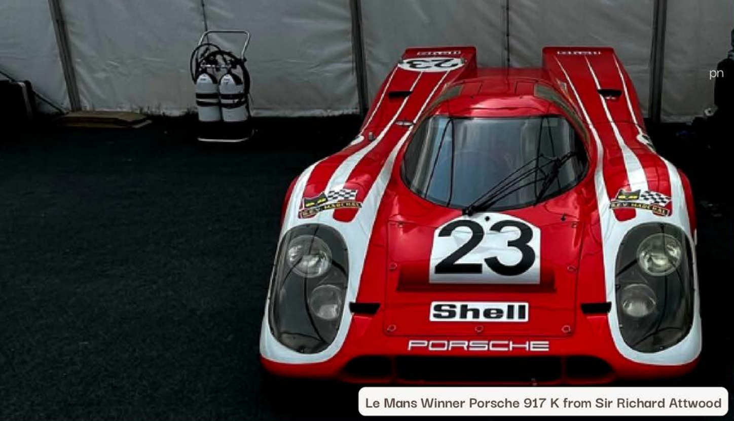
Le Mans Winner Porsche 917 K from Sir Richard Attwood