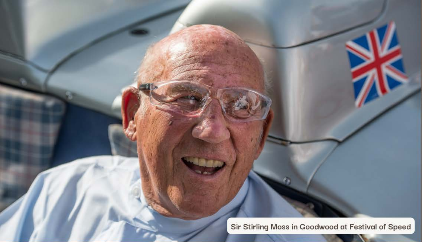
Sir Stirling Moss in Goodwood at Festival of Speed