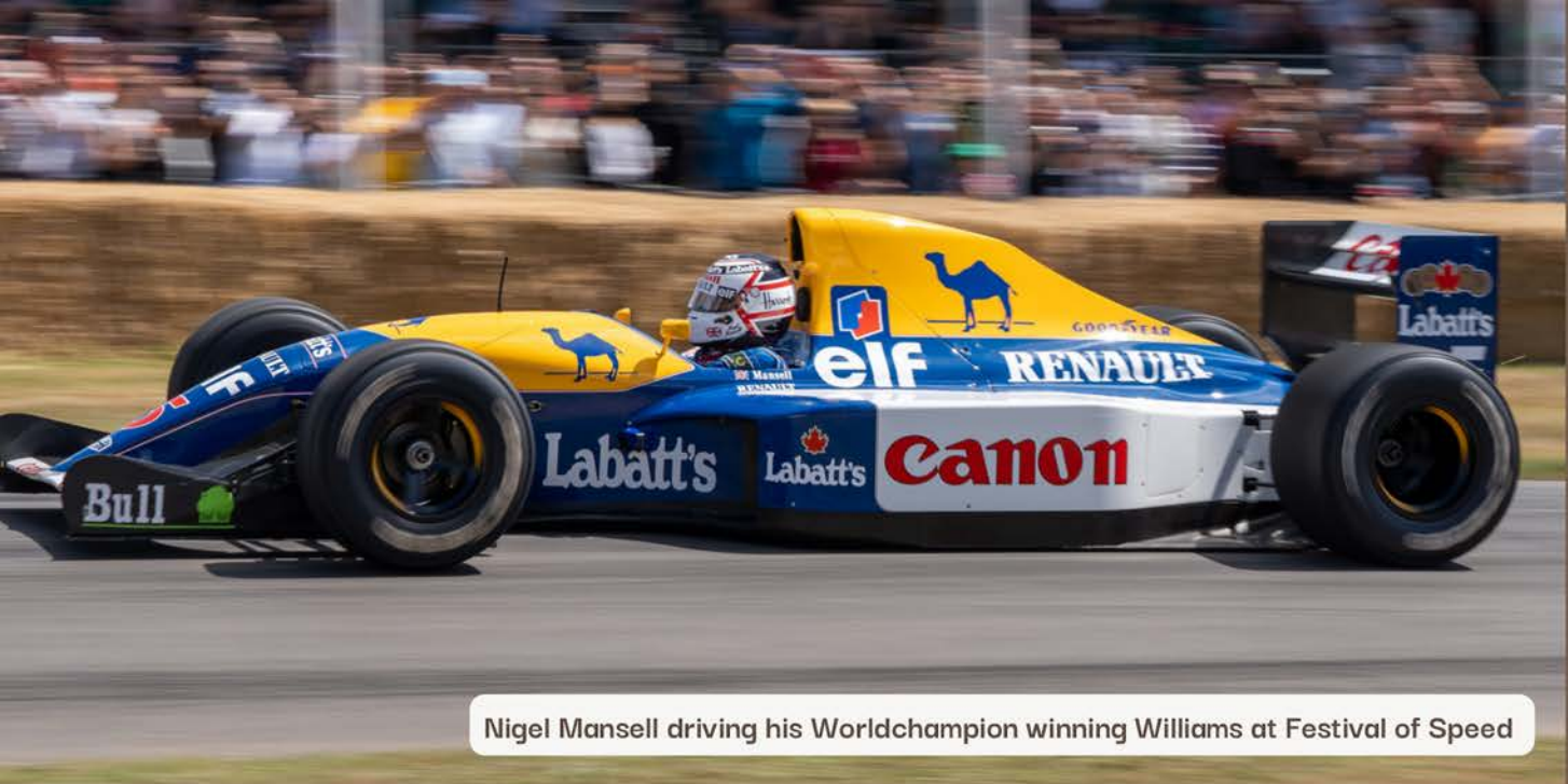
Nigel Mansell driving his Worldchampion winning Williams at Festival of Speed